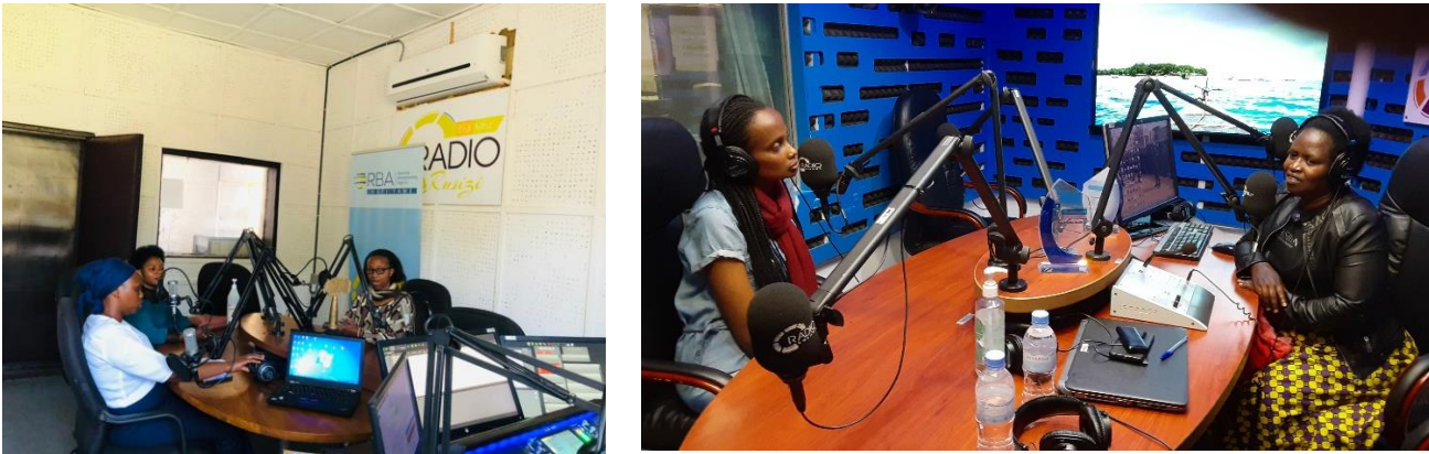
Photo: Broadcasting through Radio talk show on RBA (Rwanda Broadcasting Agency) fighting and prevention of GBV.

The community members reached in UMUGOROKA W'UMURYANGO increased their awareness and understanding of GBV prevention and response including their role in the fight against GBV at community level and timely reporting of case once they happened, and law against GBV.