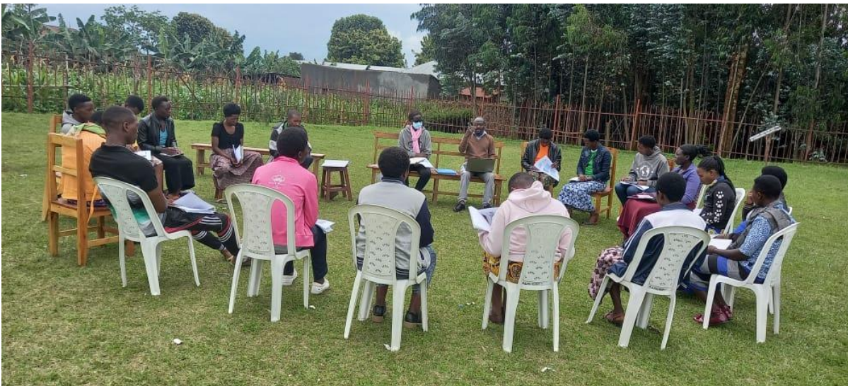
Photo: Training of teen mothers in Cosmetics on waste management in Burera District.