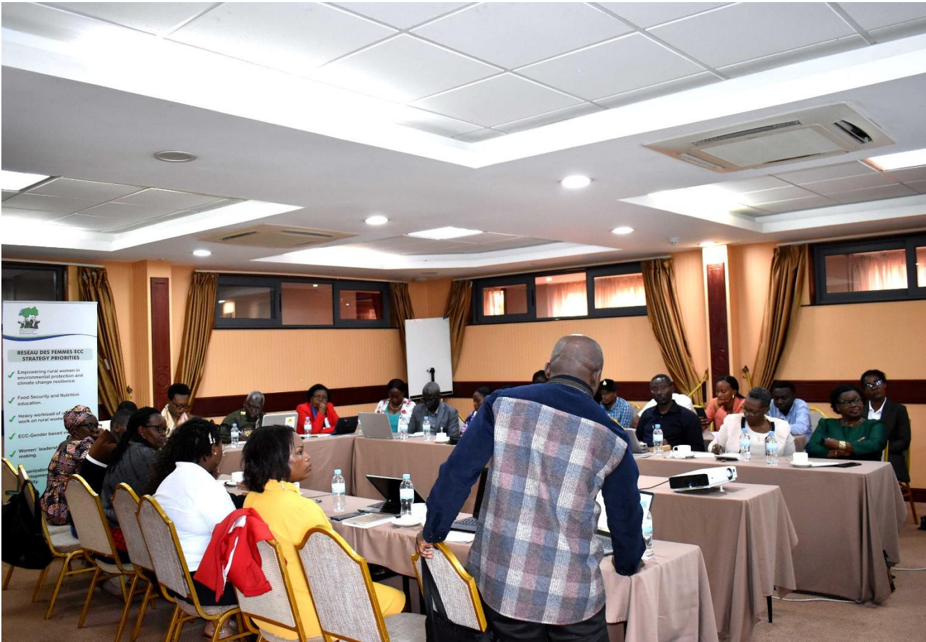
Photo: Validation Meeting of Gender and ECC- 5 years' strategic plan of Réseau des Femmes at Gland Legacy Hotel

in agriculture extension where teen mothers are farming mushrooms on small scale of land as the one way of soil management too.