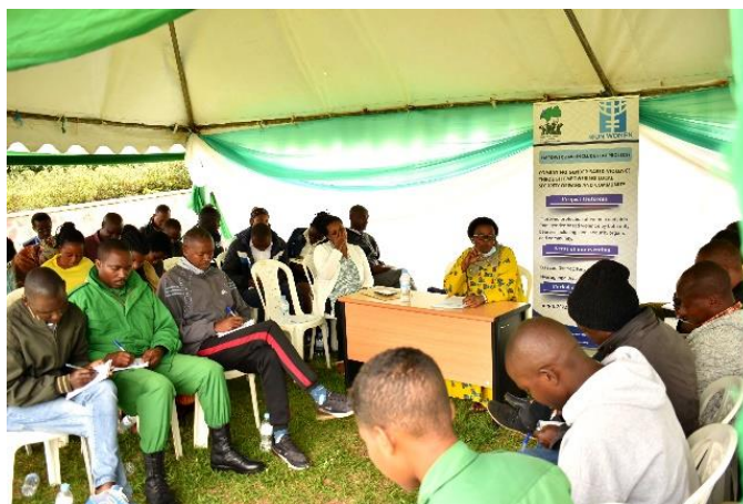
Training of DASSO and community policing at kinyinya sector 2022

The Training and Modules on GBV both helped the trainees (Agents of Change) to increase the capacity and knowledge to prevent and respond to GBV cases in their daily work.