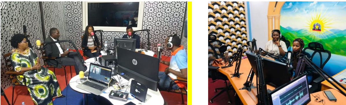
Photo: Broadcasting through Radio talk show FLASH Radio and ISANGO STAR Radio

https://www.youtube.com/watch?v=Og6iPUmGYoI&authuser=0