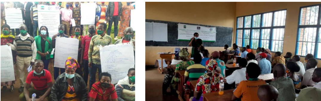
Photos: couples in training on Gender equality (positive masculinity).

In partnership with UN WOMEN, Réseau des Femmes has prepared a summarized module for dialogue and training facilitation on GBV and gender equality.