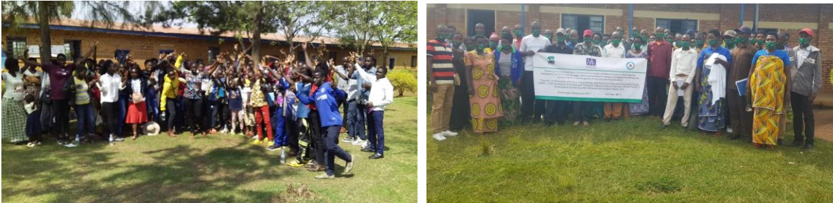
Dialogue of brothers and sisters & dialogue of couples on positive masculinity and sharing unpaid care works.

After being trained, Facilitators and staff went to train the community through dialogues on gender equality, positive masculinity and recognition, reduction and redistribution of domestic unpaid care work sharing where 100 teen mothers and their 100 brothers, 700 couples benefited that knowledge.